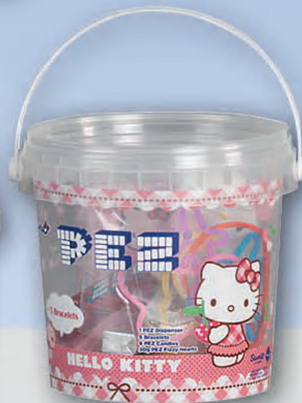
HELLO KITTY BUCKET