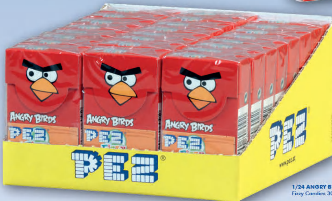
1/24 ANGRY BIRDS Fizzy Candies 30g