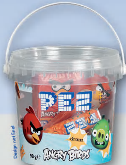
ANGRY BIRDS BUCKET