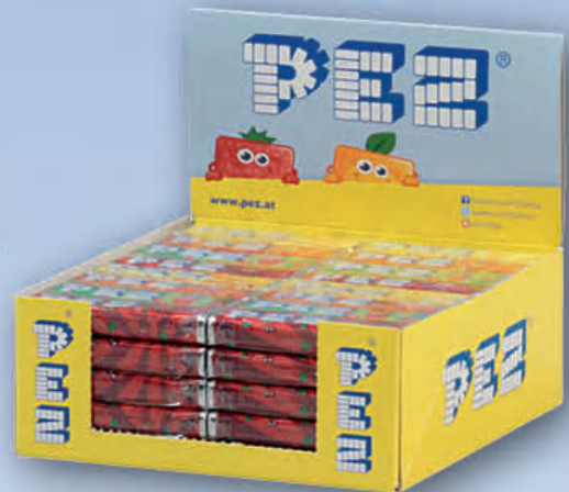
1/20 4-PACK Fruit Mix