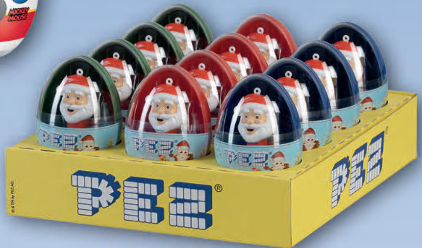
1/12 CONTAINER 1+4 (X-Mas or Easter)