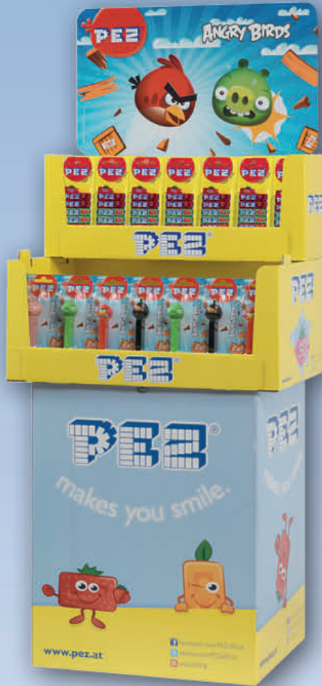
SINGLE STACK DISPLAY