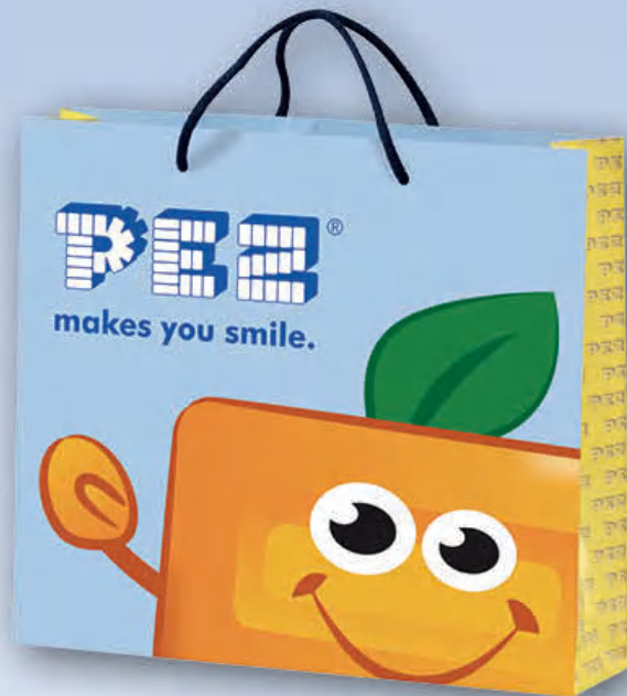
SHOPPER BAG WORLD