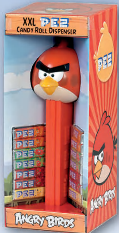
XXL DISPENSER ANGRY BIRDS