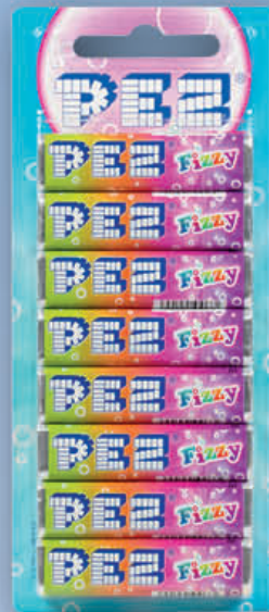
8-PACK BLISTER PEZ FIZZY