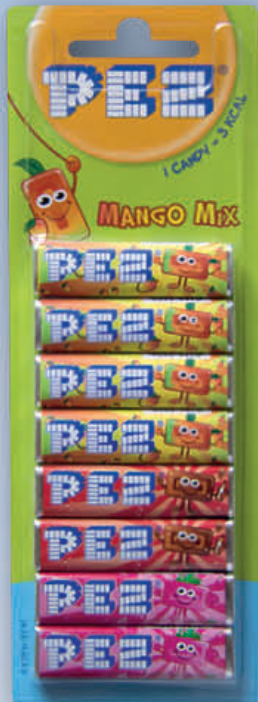
8-PACK EUROBLISTER MANGO-MIX