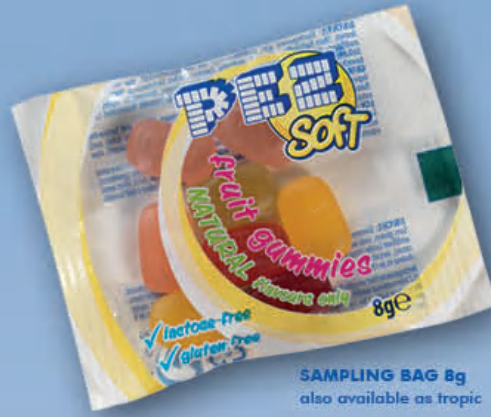
SAMPLING BAG 8g also available as tropic