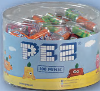
1/100 PEZ MINIS