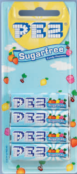
4-PACK BLISTER SUGARFREE FRUITMIX