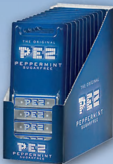
1/16 BLISTER 4-PACK