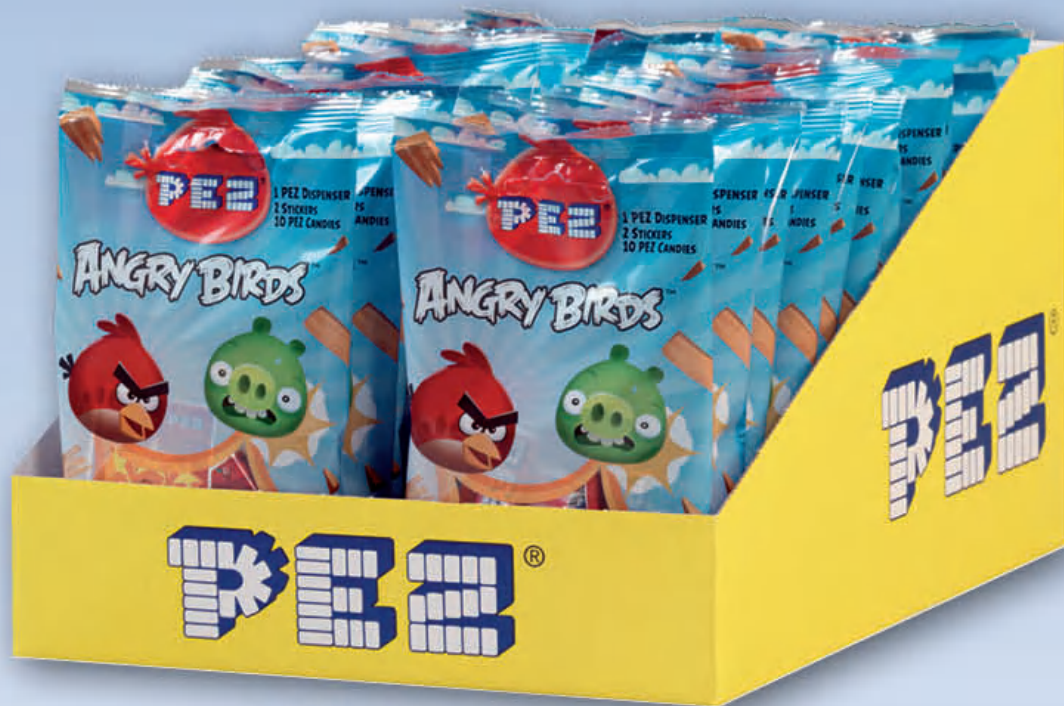
1/24 Bag Display For all 85g Bags