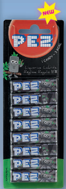
8-PACK EUROBLISTER Liquorice