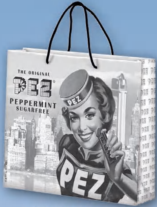
SHOPPER BAG PEPPERMINT