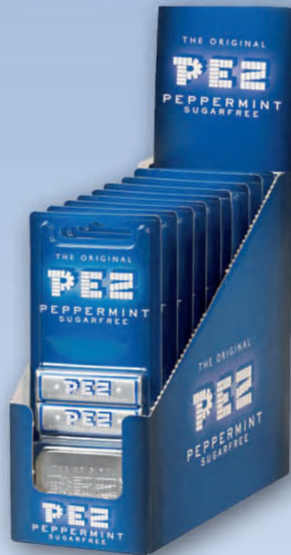
1/10 BLISTER 1+2