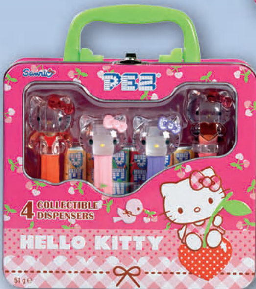
HELLO KITTY TIN