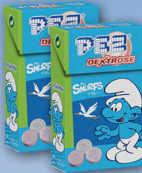
THE SMURFS DEXTROSE 30g