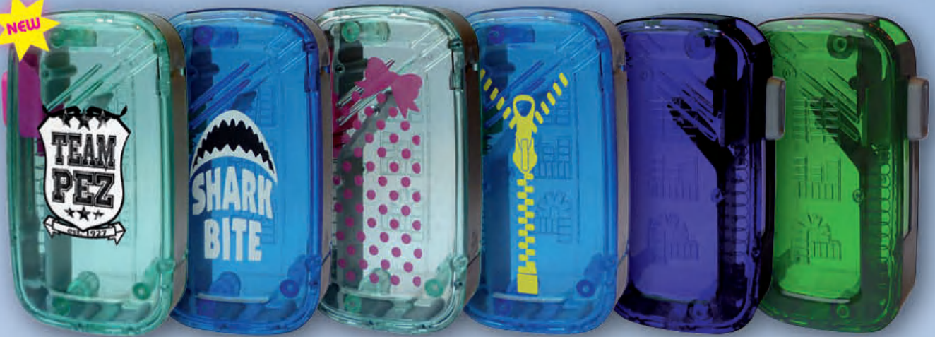
PEZ SOFT DISPENSERS