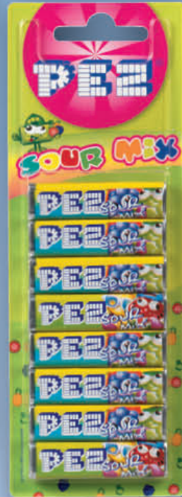
8-PACK EUROBLISTER Sour Mix