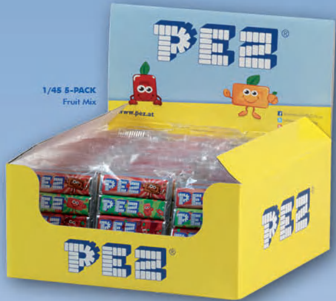
1/45 5-PACK Fruit Mix