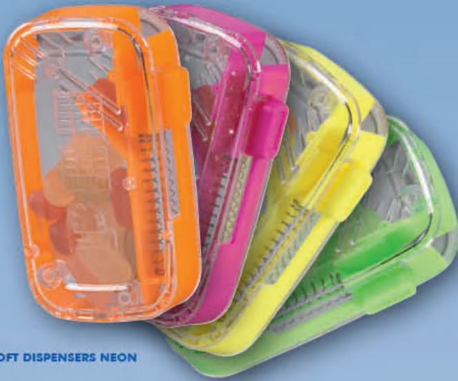
PEZ SOFT DISPENSERS NEON