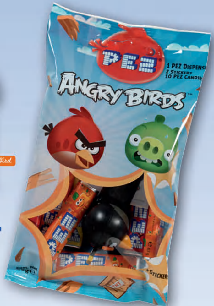
ANGRY BIRDS BAG 85g