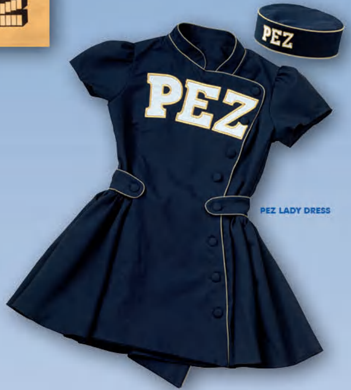
PEZ LADY DRESS