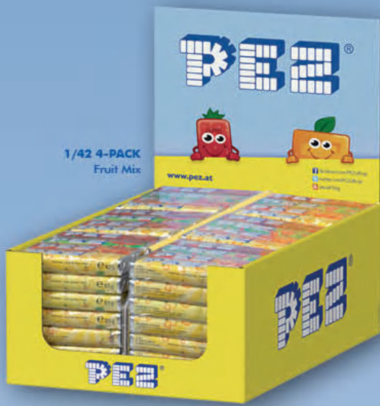
1/42 4-PACK Fruit Mix