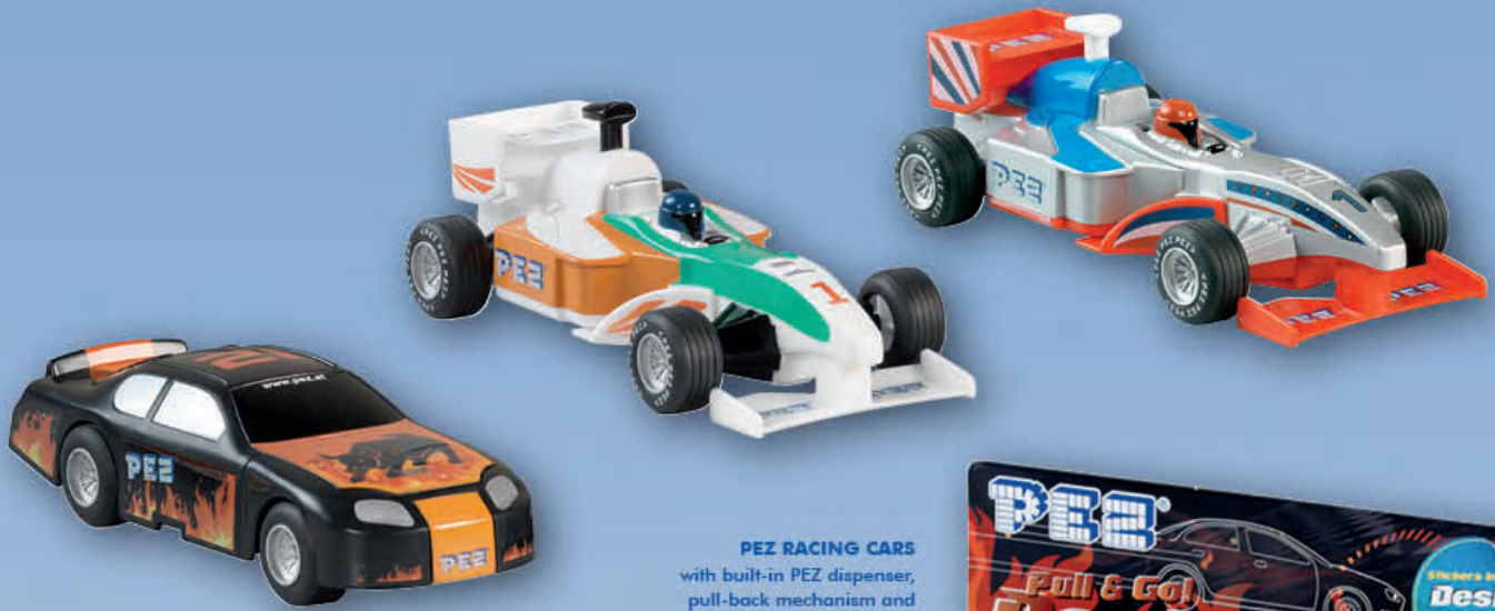
PEZ RACING CARS with built-in PEZ dispenser, pull-back mechanism and 2 x 4-packs of PEZ candy rolls.