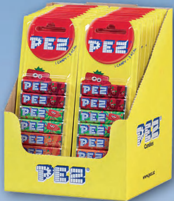
1/24 8-PACK OR 6-PACK EUROBLISTER FRUIT also available for Cola, Fizzy, Sour Mix and Mango Mix