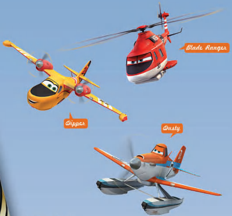
PLANES 2 BAG 85g