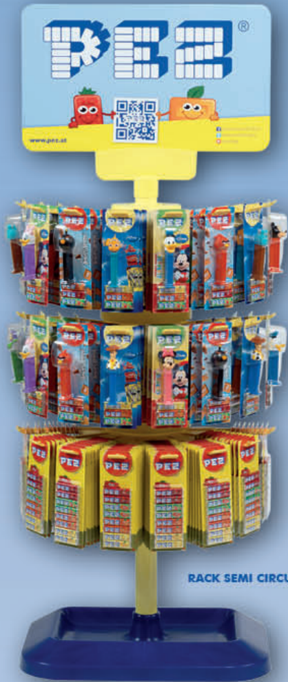
RACK SEMI CIRCULAR