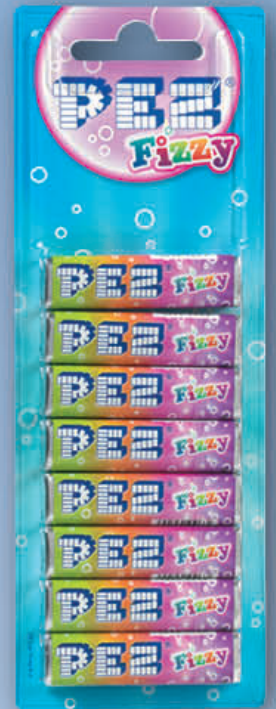
8-PACK EUROBLISTER PEZ FIZZY also available as 6-pack