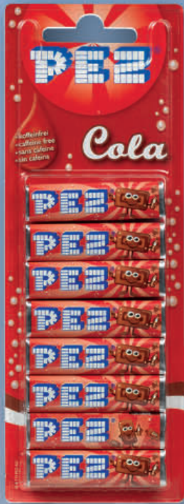
8-PACK EUROBLISTER Cola