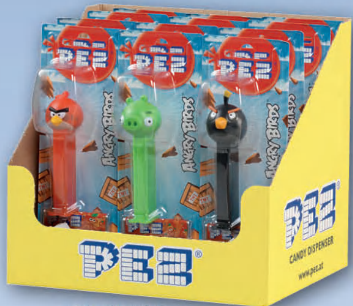
1/12 EUROBLISTER 1+3 also available for 1+2 and 1+1