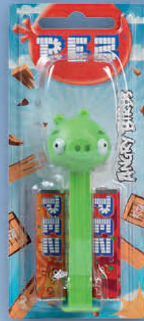
IMPULSE BLISTER 1+2