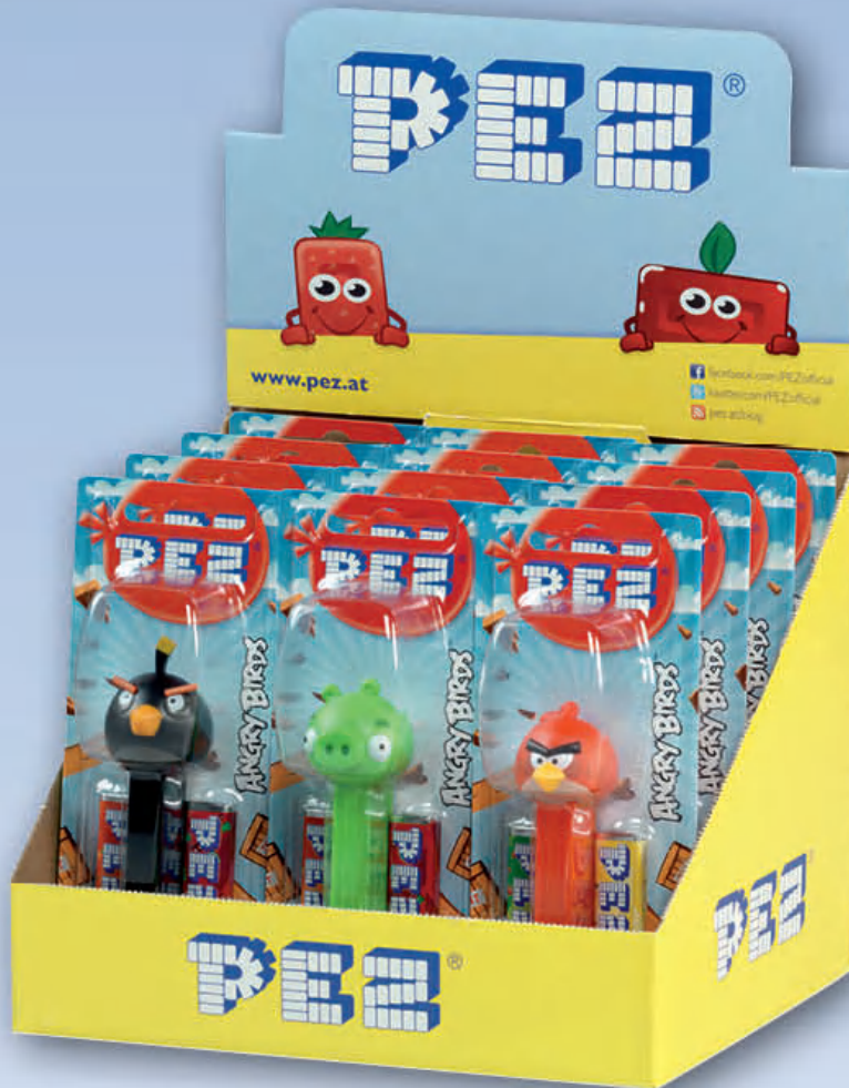
1/12 IMPULSE BLISTER 1+2 also available for 1+1