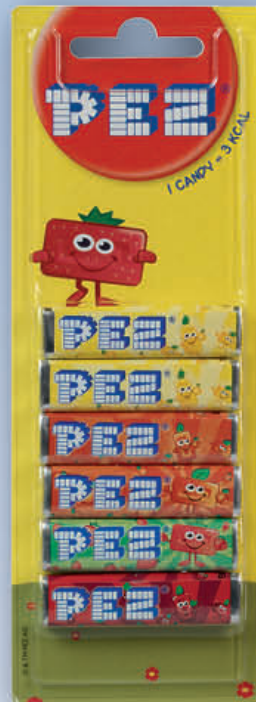
6-PACK EUROBLISTER FRUIT also available for Cola, Sour Mix and Fizzy