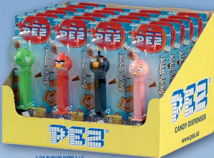
1/24 EUROBLISTER 1+3 also available for 1+2 and 1+1