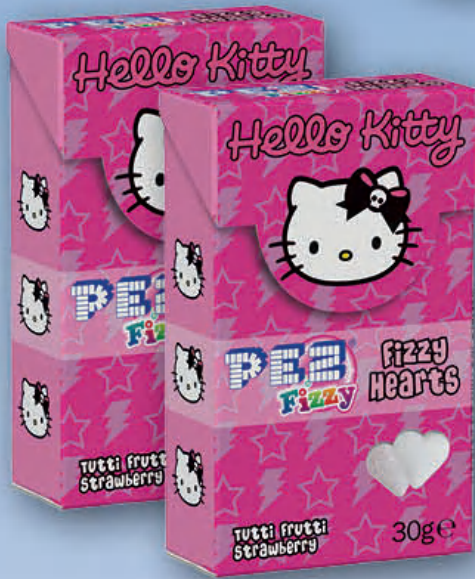
HELLO KITTY 30g