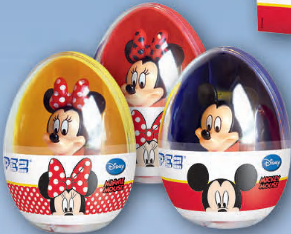
MICKEY & MINNIE EGG