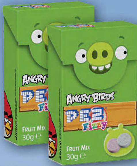
GREEN PIG 30g