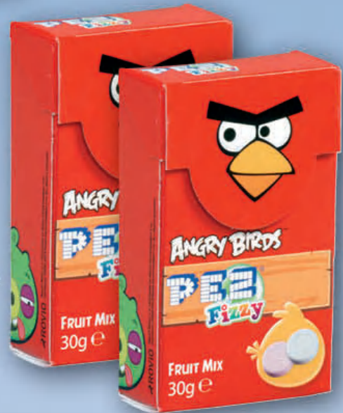
ANGRY BIRDS 30g