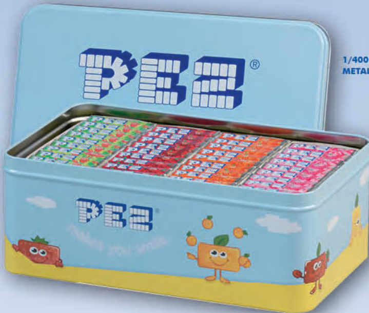
1/400 PEZ REFILL METAL CAN