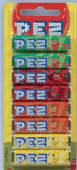
8-PACK BLISTER FRUIT also available for Cola and Fizzy