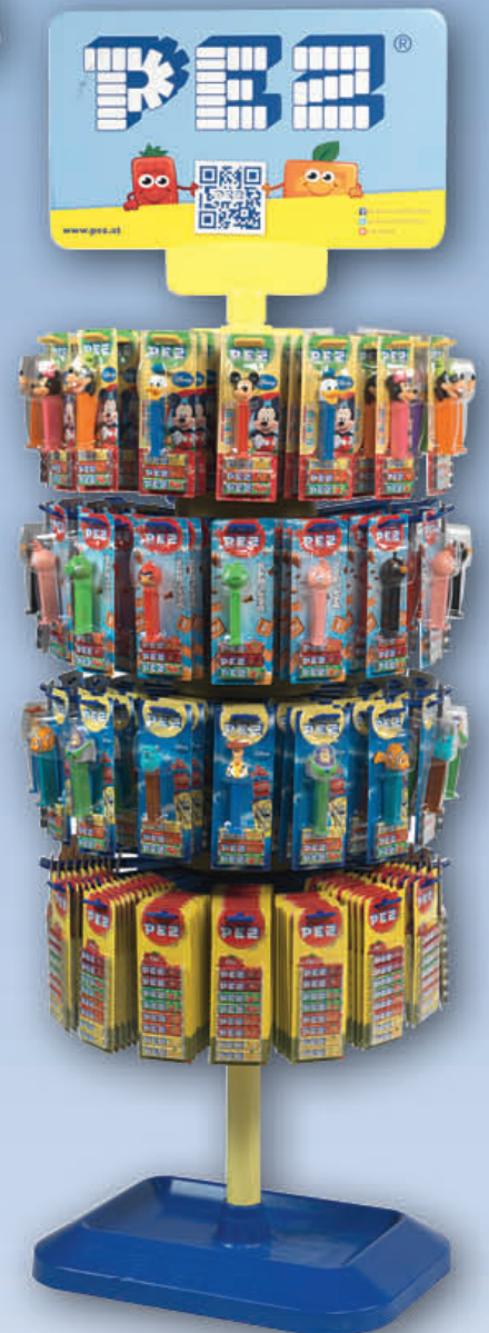
RACK LARGE CIRCULAR