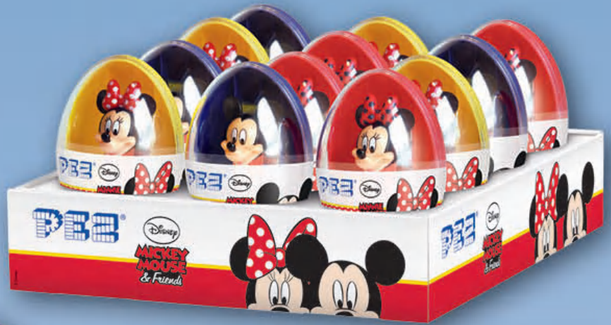
1/12 MICKEY & MINNIE EGG 1+4