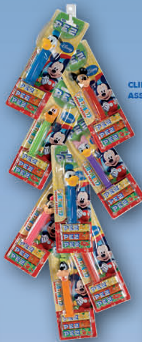
CLIP STRIP ASSEMBLED