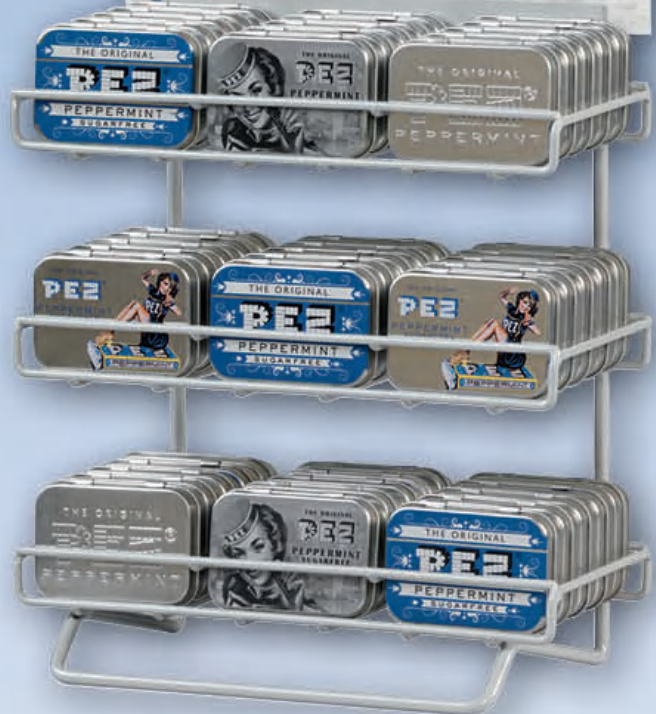
1/45 SHELF DISPLAY filled with tins 16g