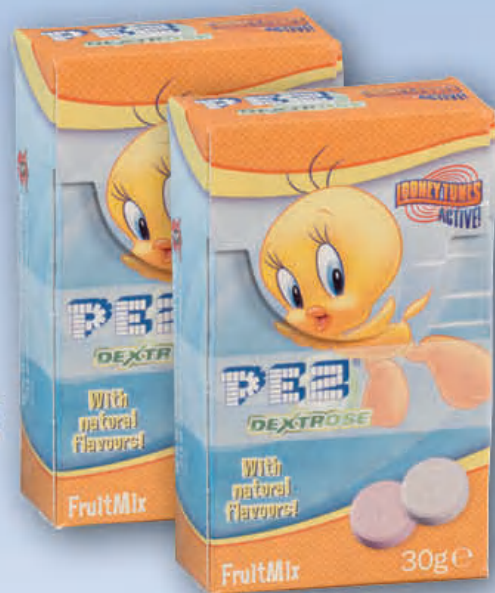
TWEETY DEXTROSE 30g