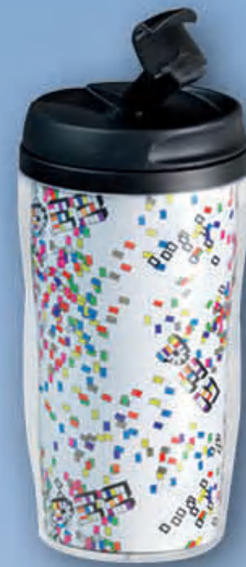
COFFEE 2 GO CUP