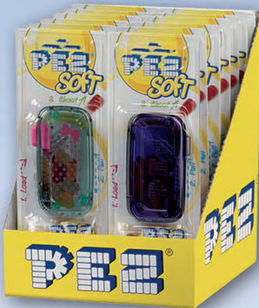
1/12 EUROBLISTER 2-FACING 1+20g