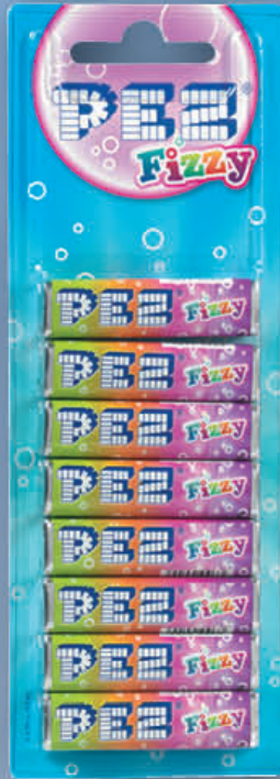
8-PACK EUROBLISTER Fizzy