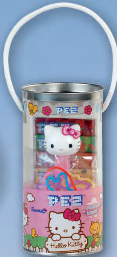
HELLO KITTY GIFT CAN