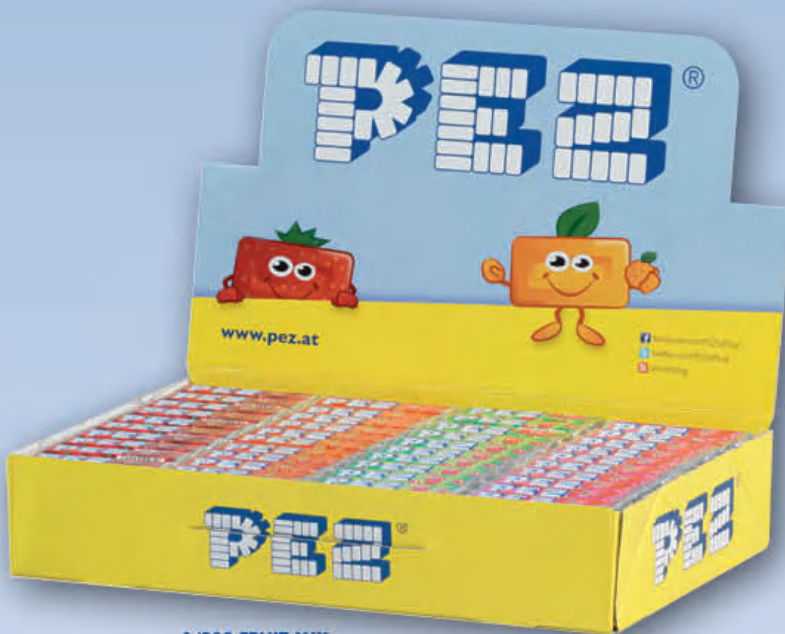
1/200 FRUIT MIX