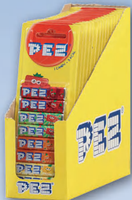
1/12 8-PACK BLISTER FRUIT also available for Cola, Fizzy, Sour Mix, Mango Mix and Liquorice