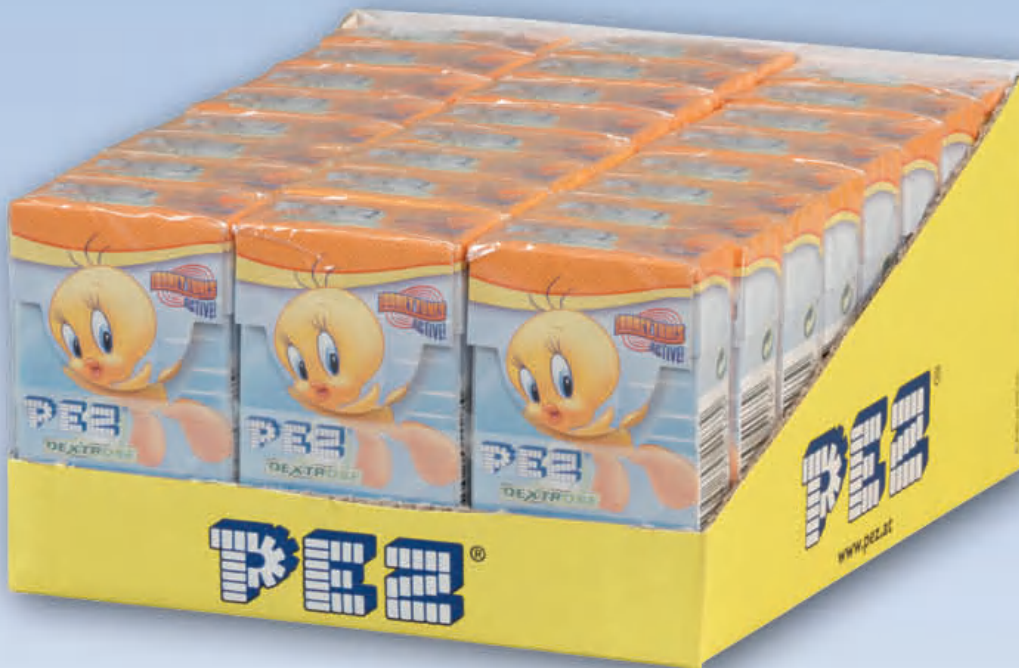
1/24 DEXTROSE 30g