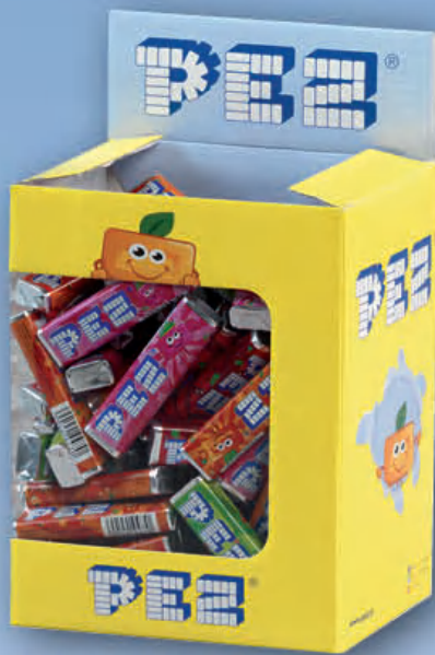
1/100 SINGLE REFILL FRUIT