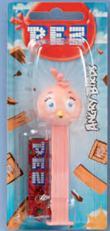
IMPULSE BLISTER 1+1