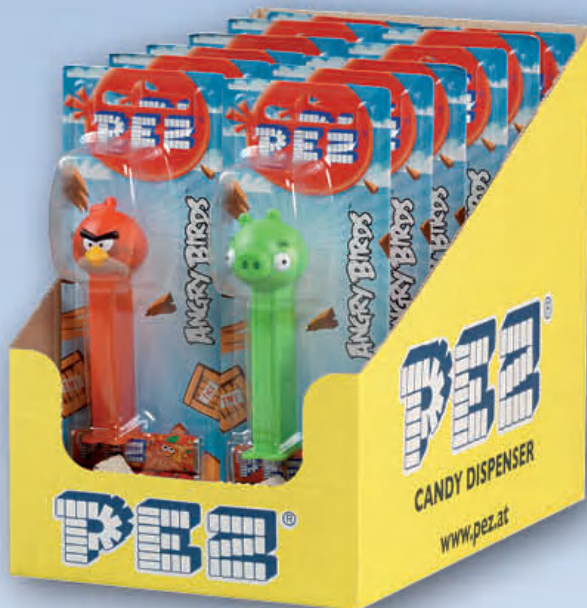
1/12 EUROBLISTER 2-FACING 1+3 also available for 1+2 and 1+1