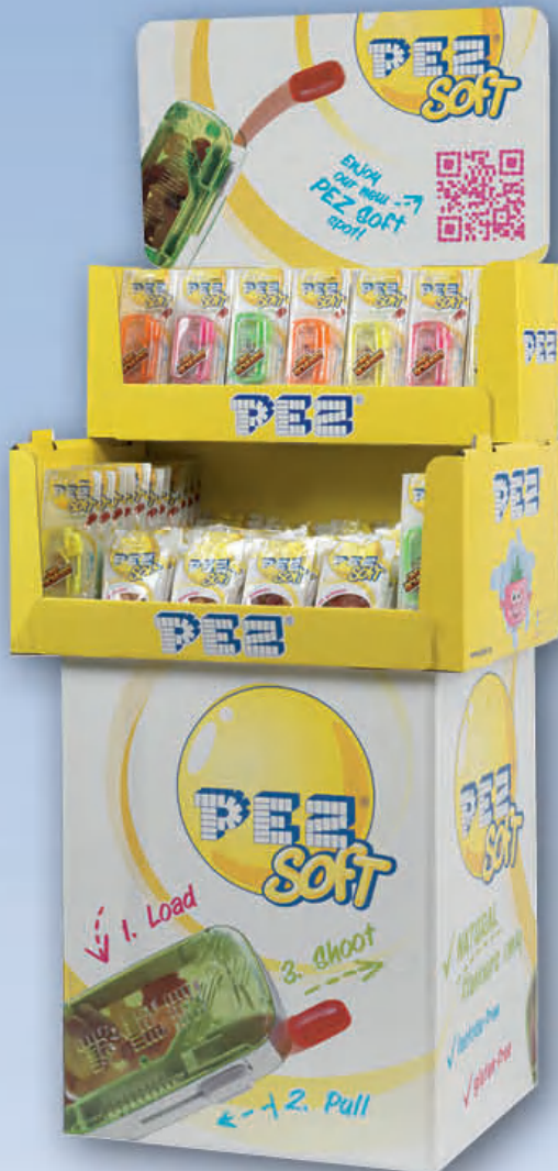
SINGLE STACK DISPLAY