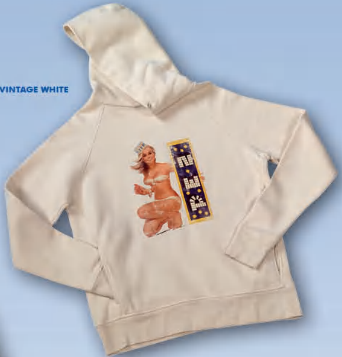
HOODIE VINTAGE WHITE