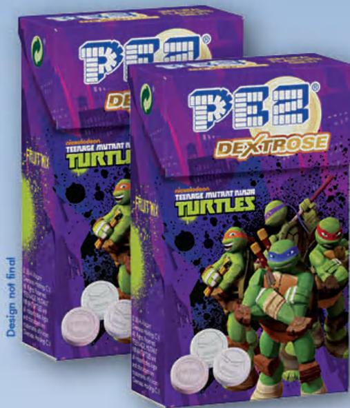
TURTLES DEXTROSE 30g