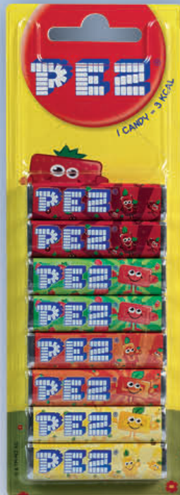
8-PACK EUROBLISTER FRUIT