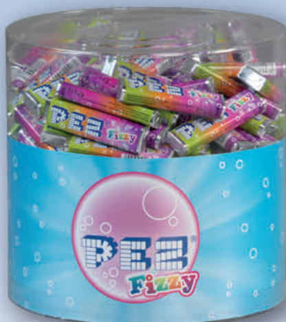
1/150 PEZ FIZZY