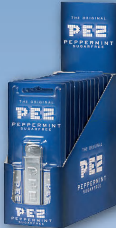
1/12 BLISTER 1+2