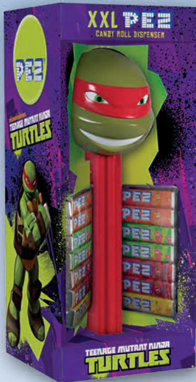
XXL DISPENSER TURTLES