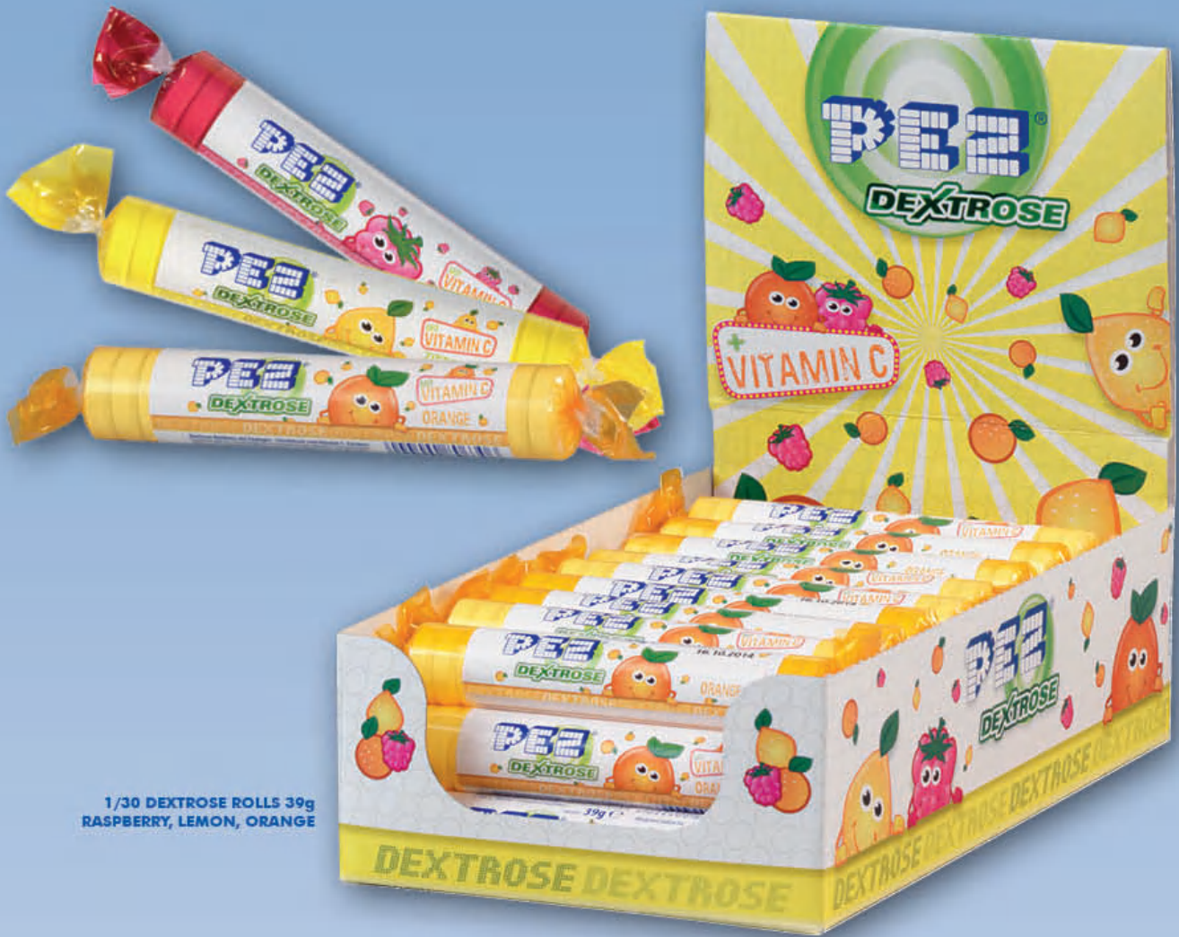
1/30 DEXTROSE ROLLS 39g RASPBERRY, LEMON, ORANGE