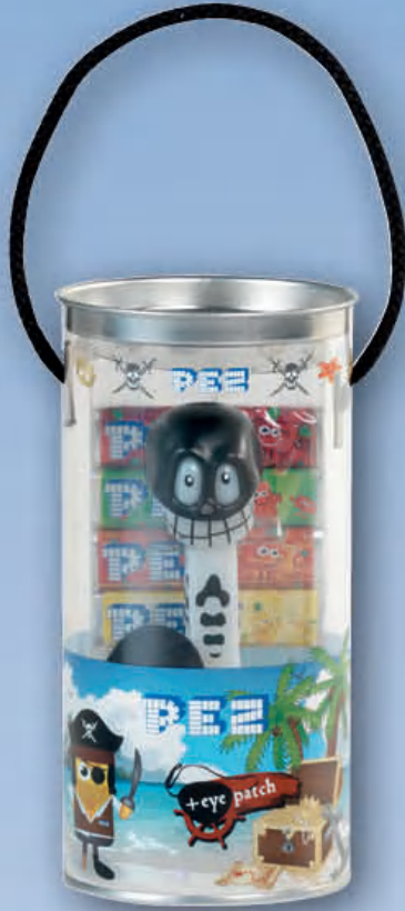
PIRATES GIFT CAN