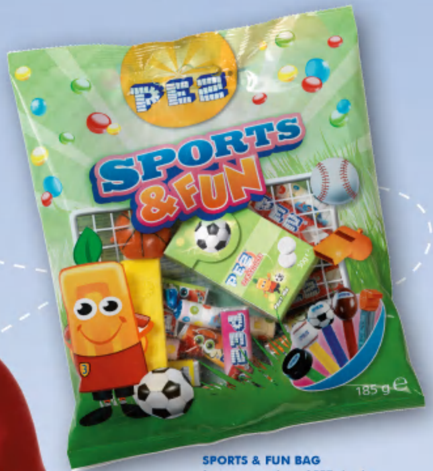
SPORTS & FUN BAG features a variety of PEZ classics.