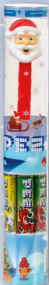
XMAS TUBE 1+7 Fruit