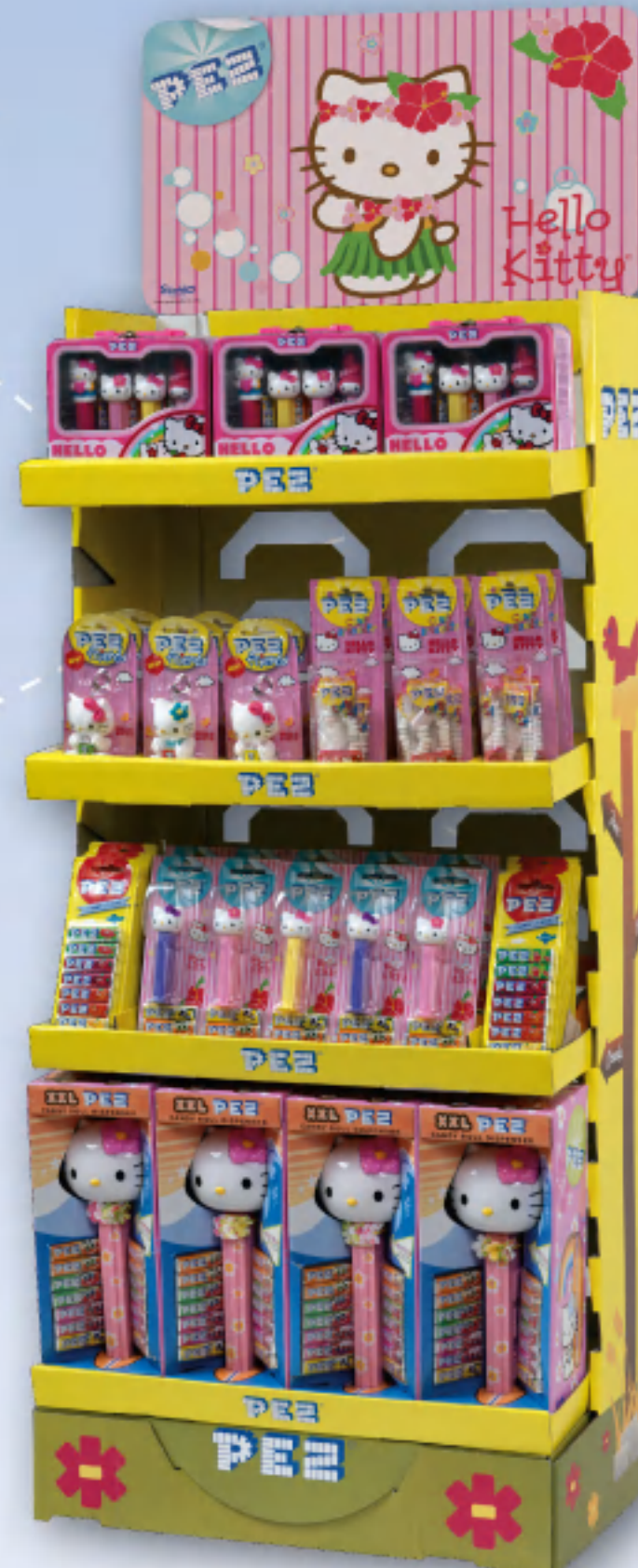
VARIABLE FLOOR DISPLAY various ways of filling