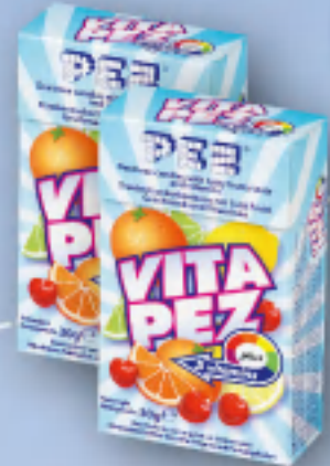
1/24 Vita PEZ Dextrose 30g