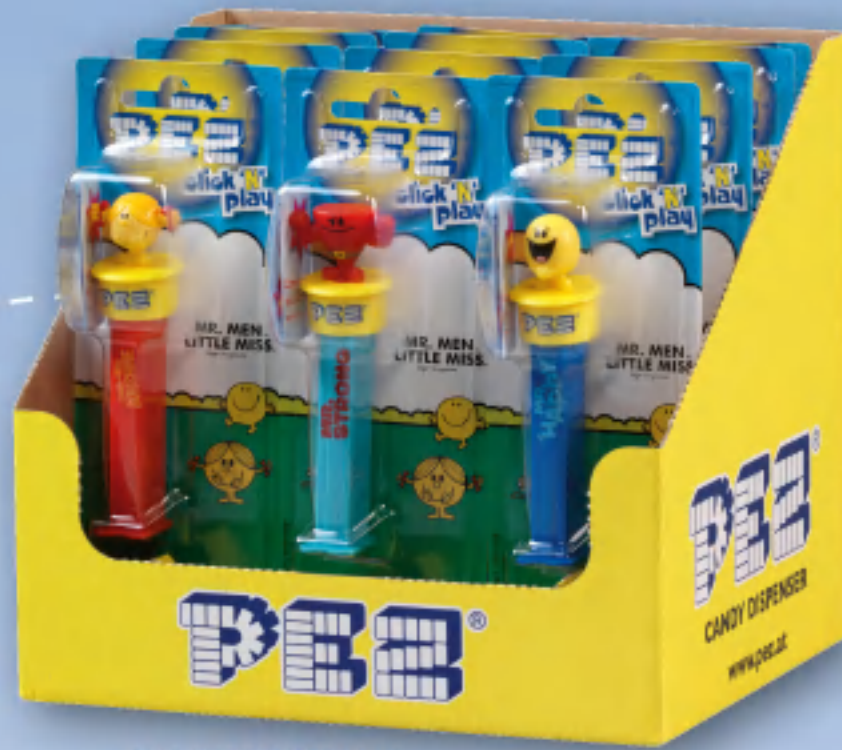
1/12 EUROBLISTER 1+2 also available for 1+3 and 1+1