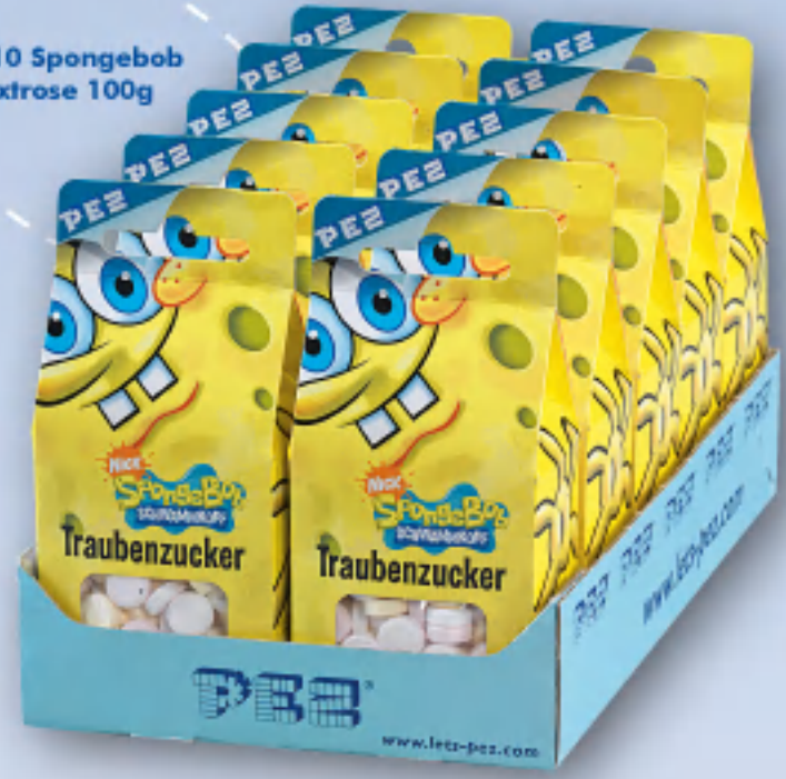
1/10 Spongebob Dextrose 100g