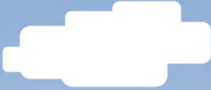
1/45 5-PACK Fruit Mix