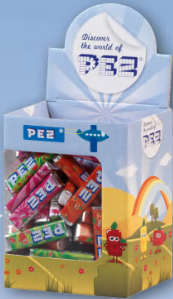
1/100 SINGLE REFILL FRUIT