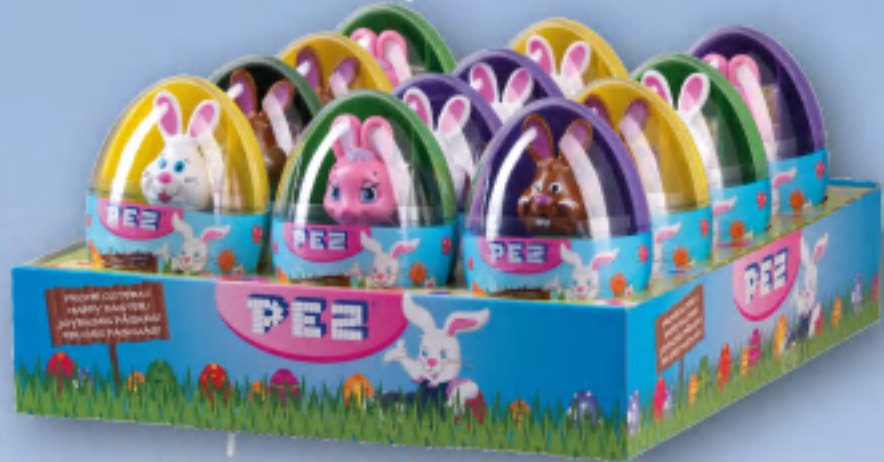
1/12 EASTER EGG 1+4