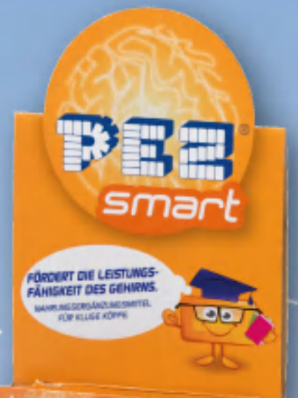
1/12 PEZ SMART 1+2