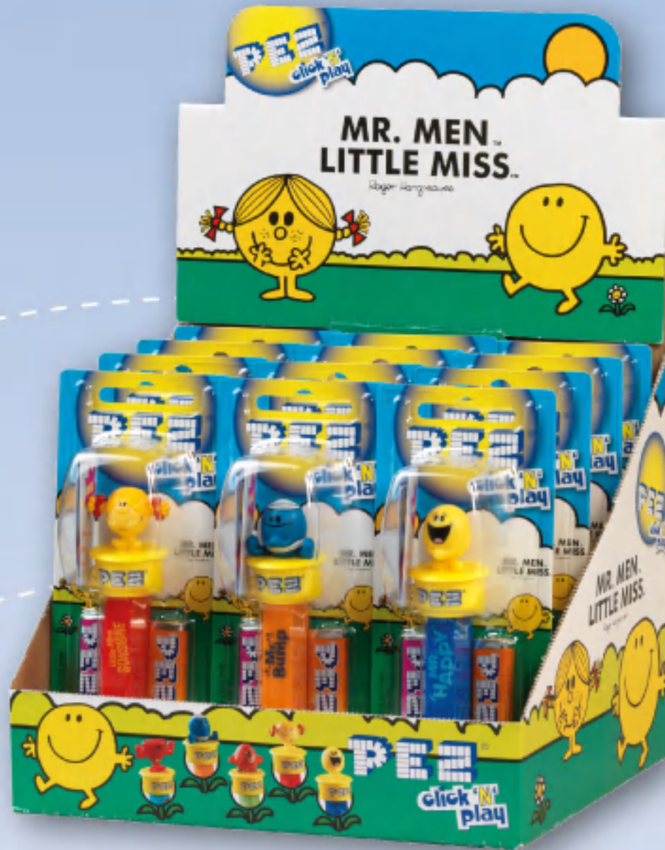
1/12 IMPULSE BLISTER 1+2 also available for 1+1