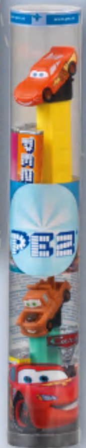
CARS TUBE 2+4 Fruit