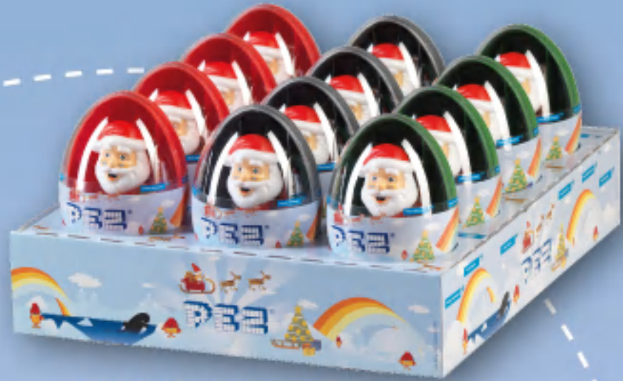
1/12 X-MAS CONTAINER 1+4