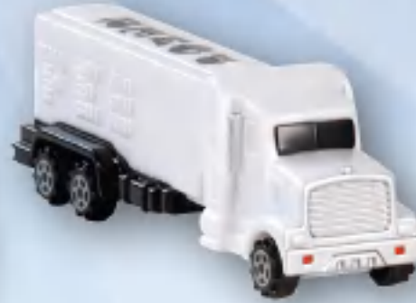
US Truck 2