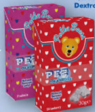
1/24 Polka Bears Dextrose 30g