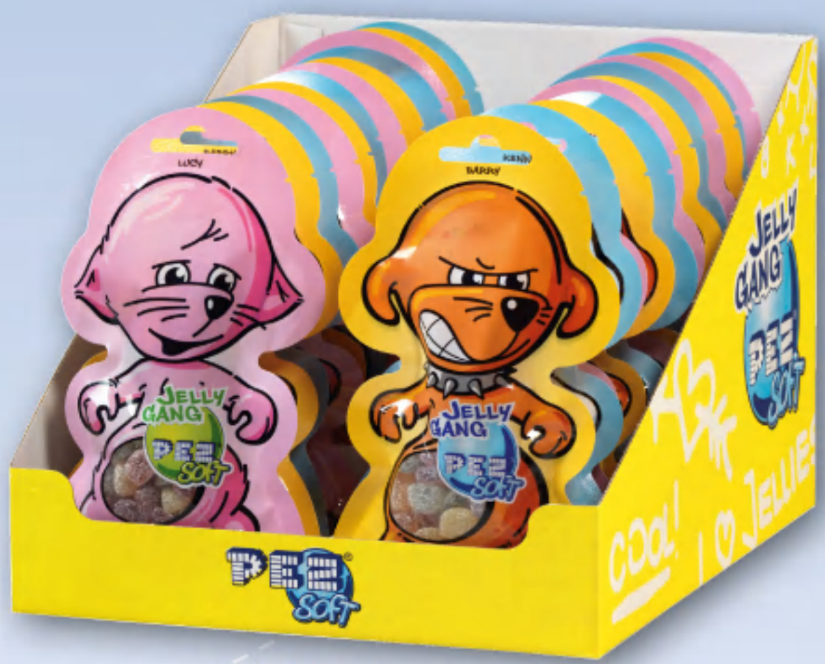
1/24 JELLY GANG