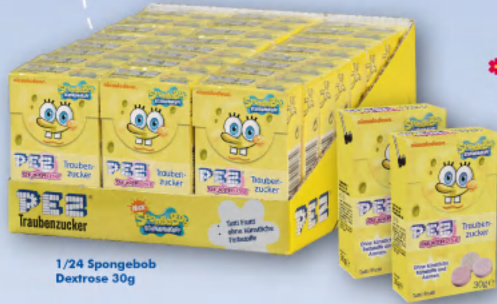
1/24 Spongebob Dextrose 30g