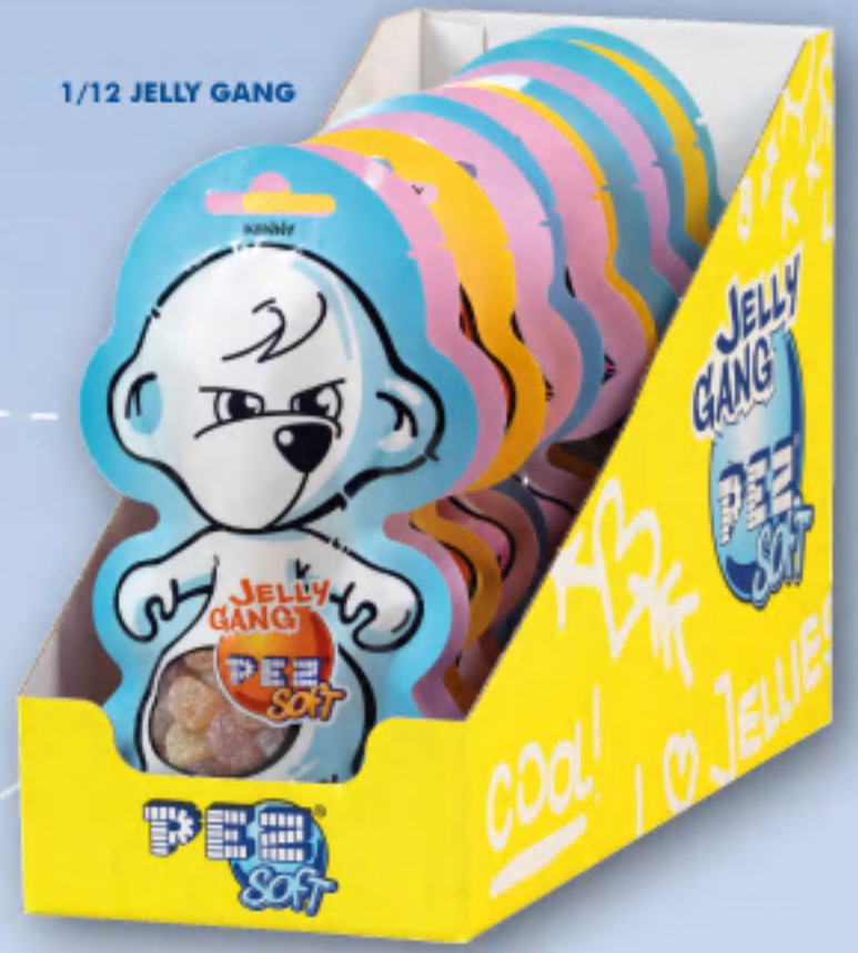
1/12 JELLY GANG