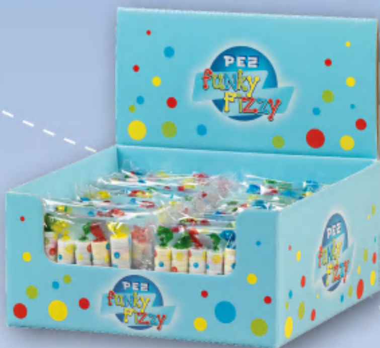
Funky Fizzy 1/30 4+1 multipack 6g