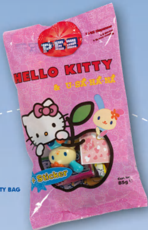
HELLO KITTY BAG