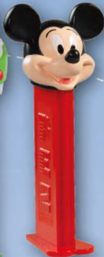
XXL DISPENSER MICKEY MOUSE