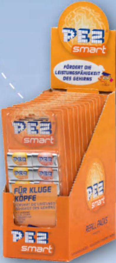
1/12 PEZ SMART REFILLS 14-PACK