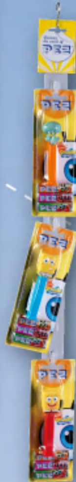
CLIP STRIP PLASTIC