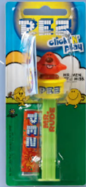
IMPULSE BLISTER 1+1