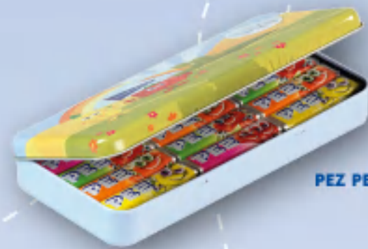
PEZ PENCIL BOX