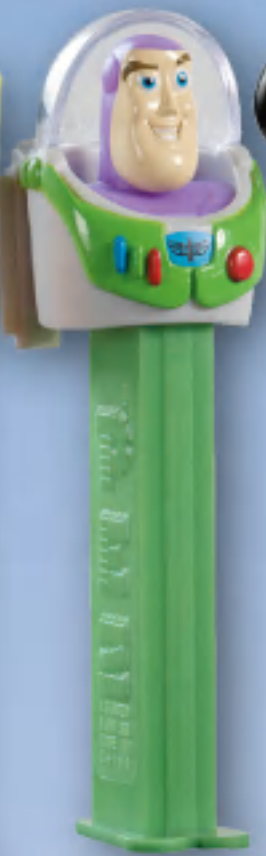
XXL DISPENSER BUZZ LIGHTYEAR