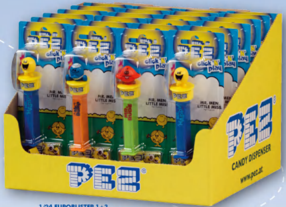
1/24 EUROBLISTER 1+3 also available for 1+2 and 1+1