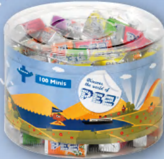
1/100 PEZ MINIS