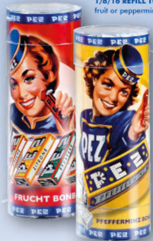
1/8/16 REFILL TUBE fruit or peppermint