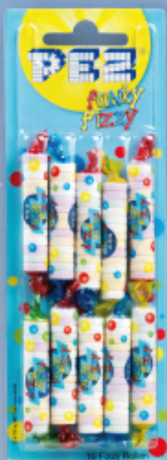
Funky Fizzy Rolls 10-pack 6g