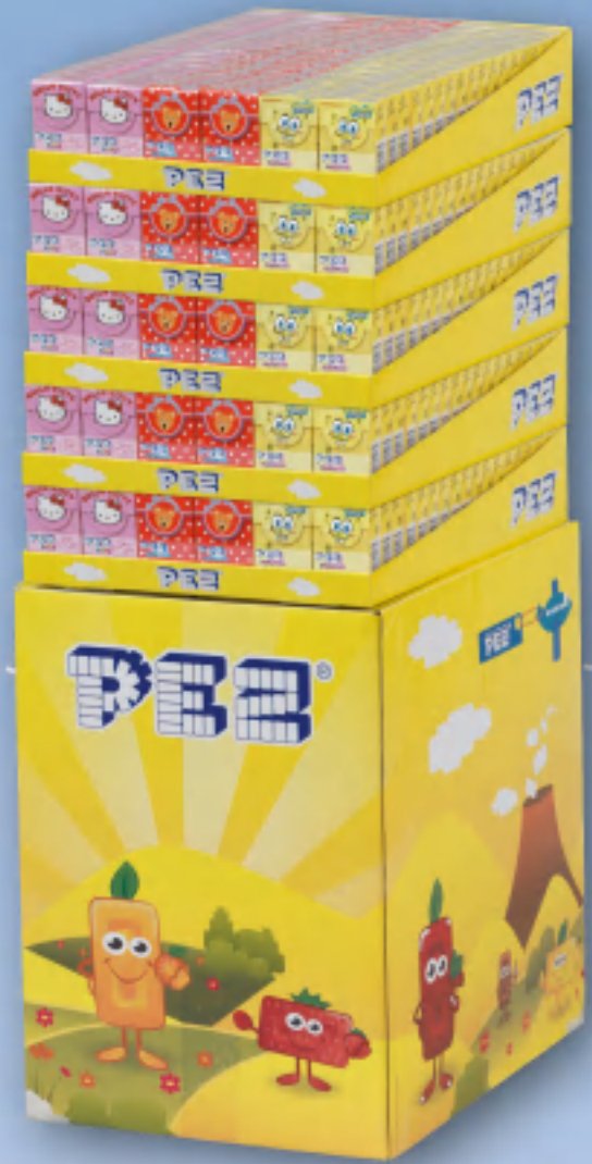
1/270 Z-CCLICK DISPLAY