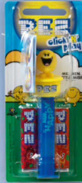
IMPULSE BLISTER 1+2