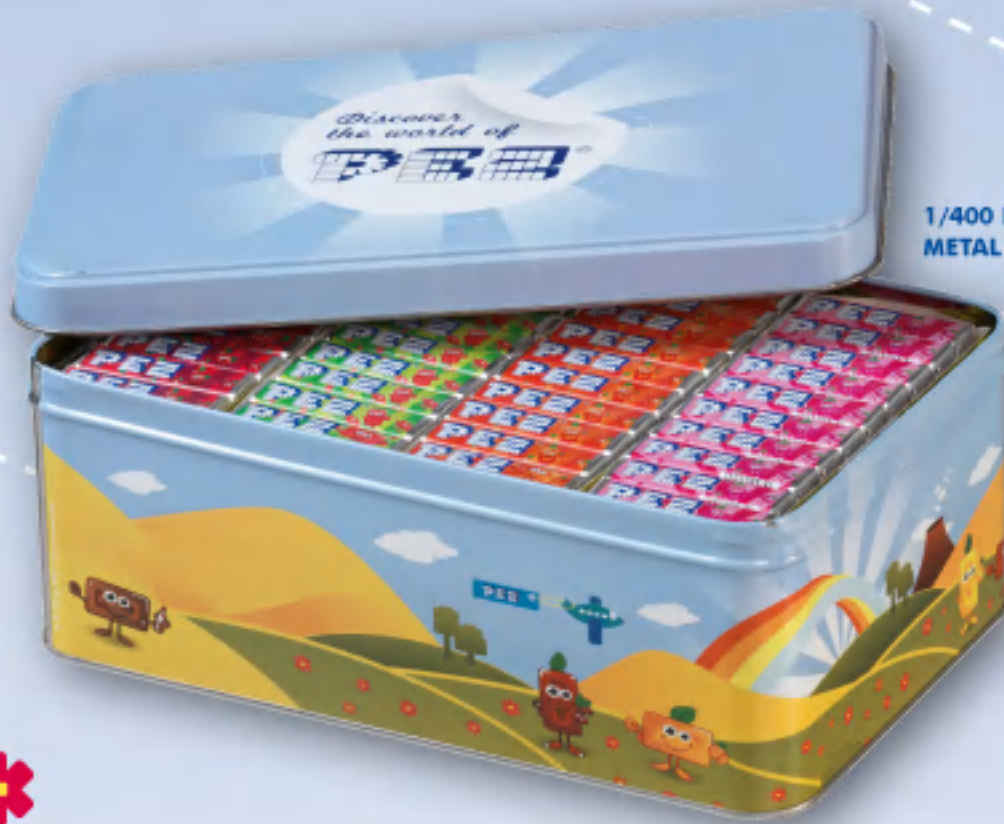
1/400 PEZ REFILL METAL CAN