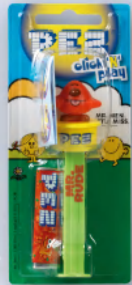
IMPULSE BLISTER 1+1