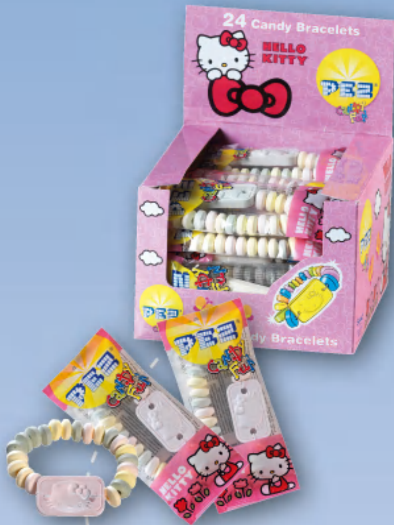
1/24 CANDY FUN BRACELETS