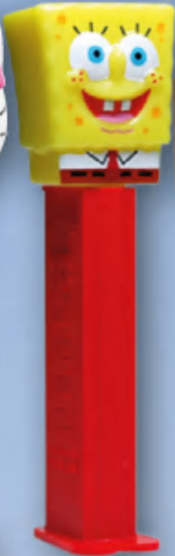
XXL DISPENSER SPONGEBOB