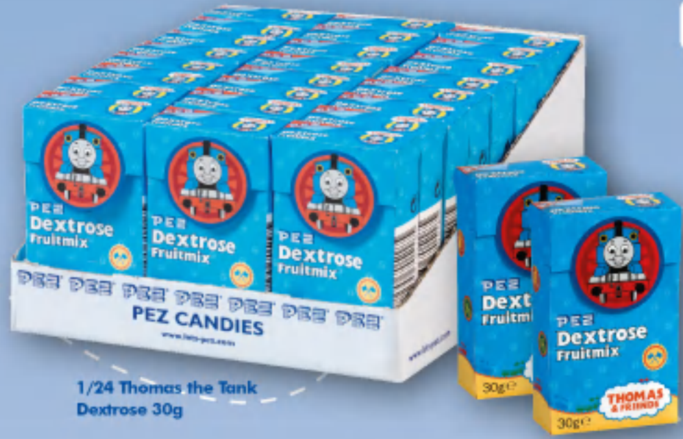
1/24 Thomas the Tank Dextrose 30g