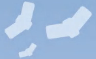
HELLO KITTY TIN