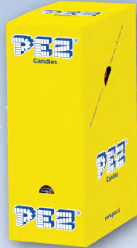
1/12 8-PACK BLISTER FRUIT also available for Cola, Winter & Summer Fruit Mix and Sour Mix