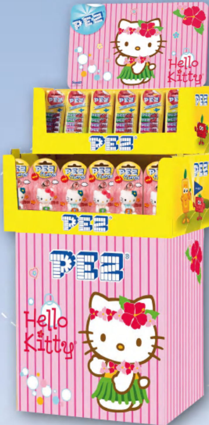
SINGLE STACK DISPLAY PEZ FRIENDS HELLO KITTY also available for Mickey Mouse