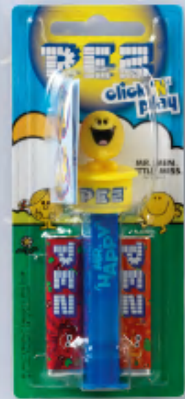
IMPULSE BLISTER 1+2