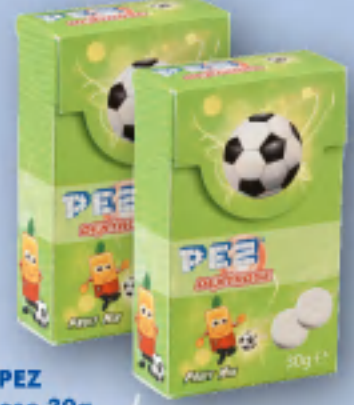
1/24 PEZ Dextrose 30g