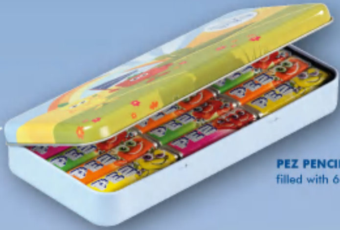
PEZ PENCIL BOX filled with 6 x 4 packs of PEZ candy rolls.