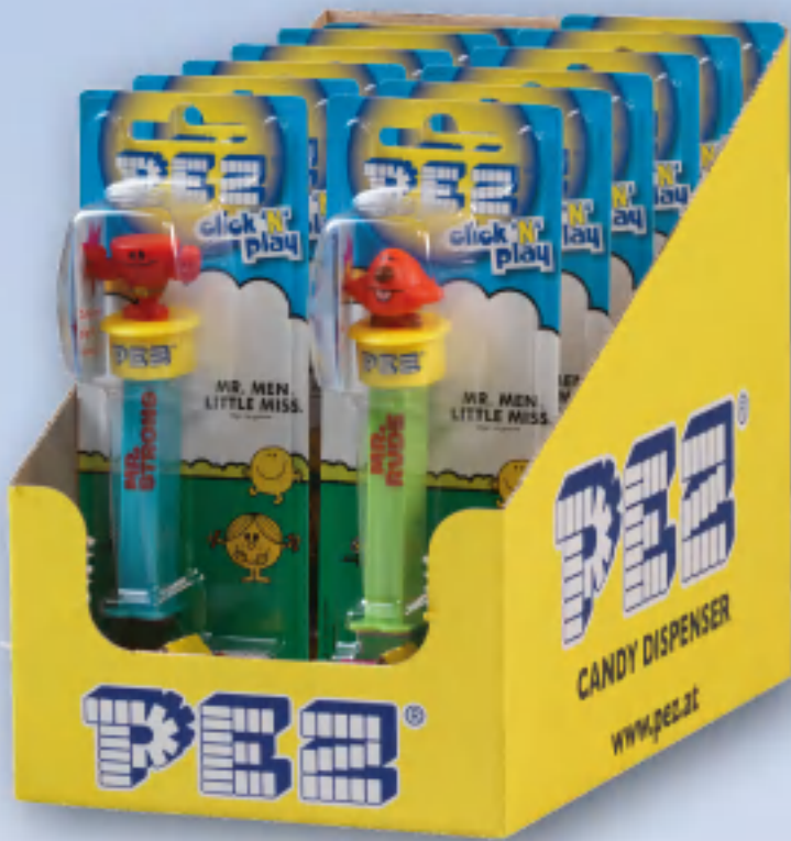
1/12 EUROBLISTER 2-FACING 1+3 also available for 1+2 and 1+1