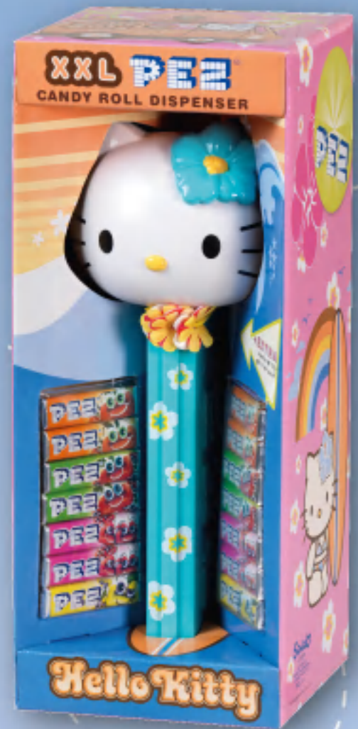
XXL DISPENSER HELLO KITTY

PEZ SPORTS CAR with built-in PEZ dispenser, pull-back mechanism and 2 x 4 packs of PEZ candy rolls.