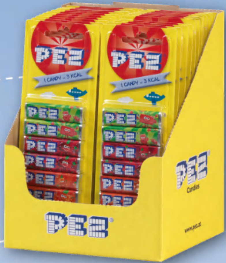
1/24 8-PACK OR 6-PACK EUROBLISTER FRUIT also available for Cola, Winter & Summer Fruit Mix and Sour Mix