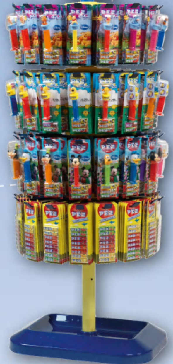
RACK LARGE CIRCULAR