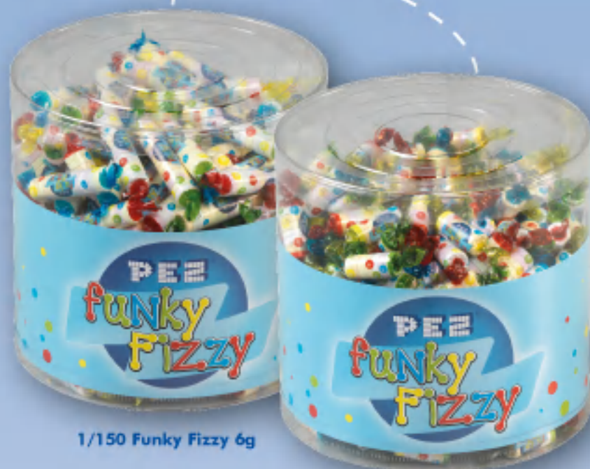
1/150 Funky Fizzy 6g