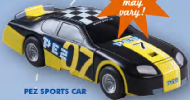
PEZ SPORTS CAR