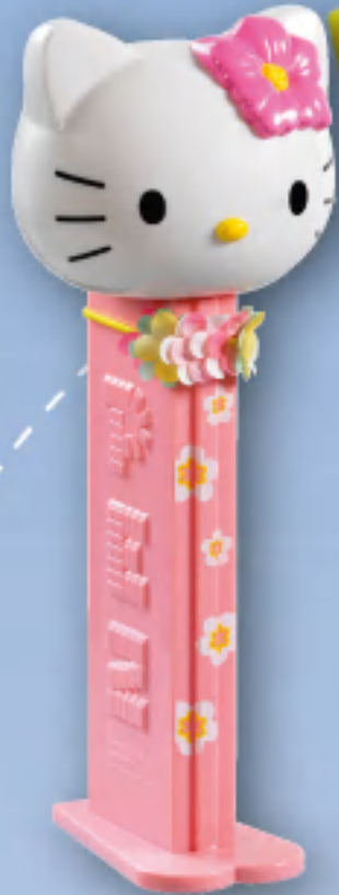
XXL DISPENSER HELLO KITTY